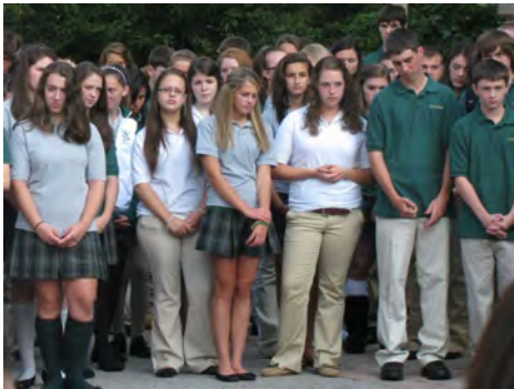
The Matignon community gathered in front of the school at the American flag to honor and remember this day.